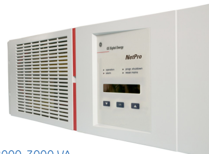
NetPro 19" 2000-3000 VA